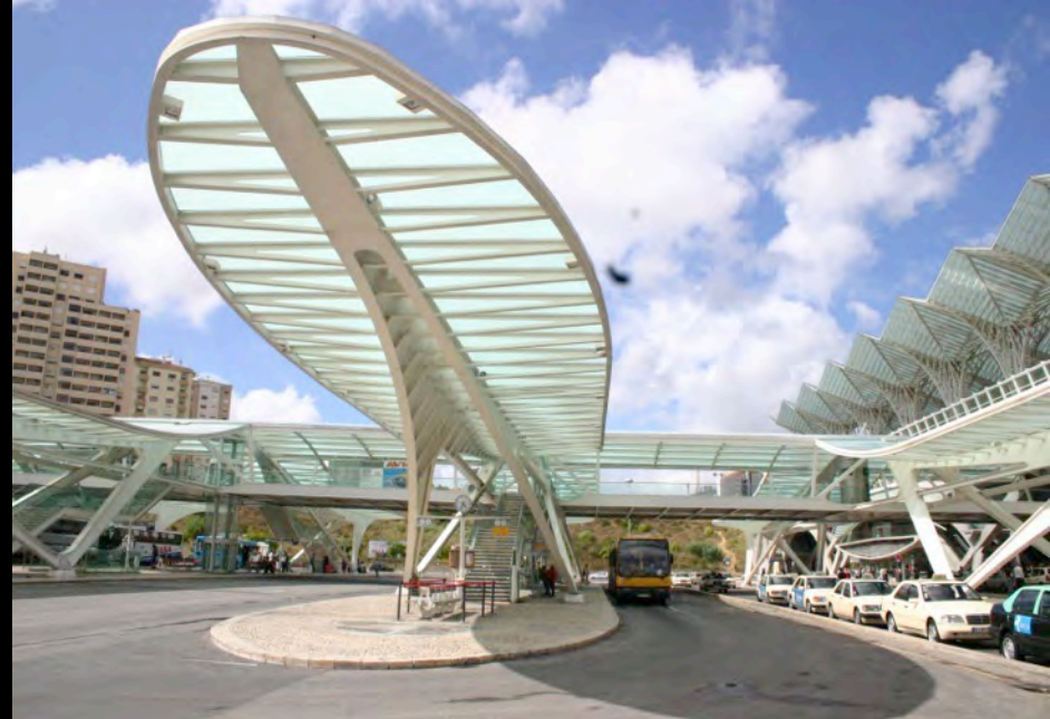
Multi-modal Orient Station and the redeveloped area from the Expo 98