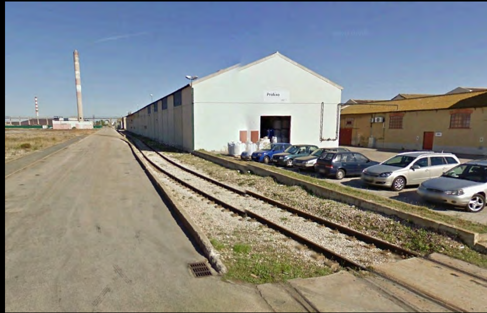
Views of the project area