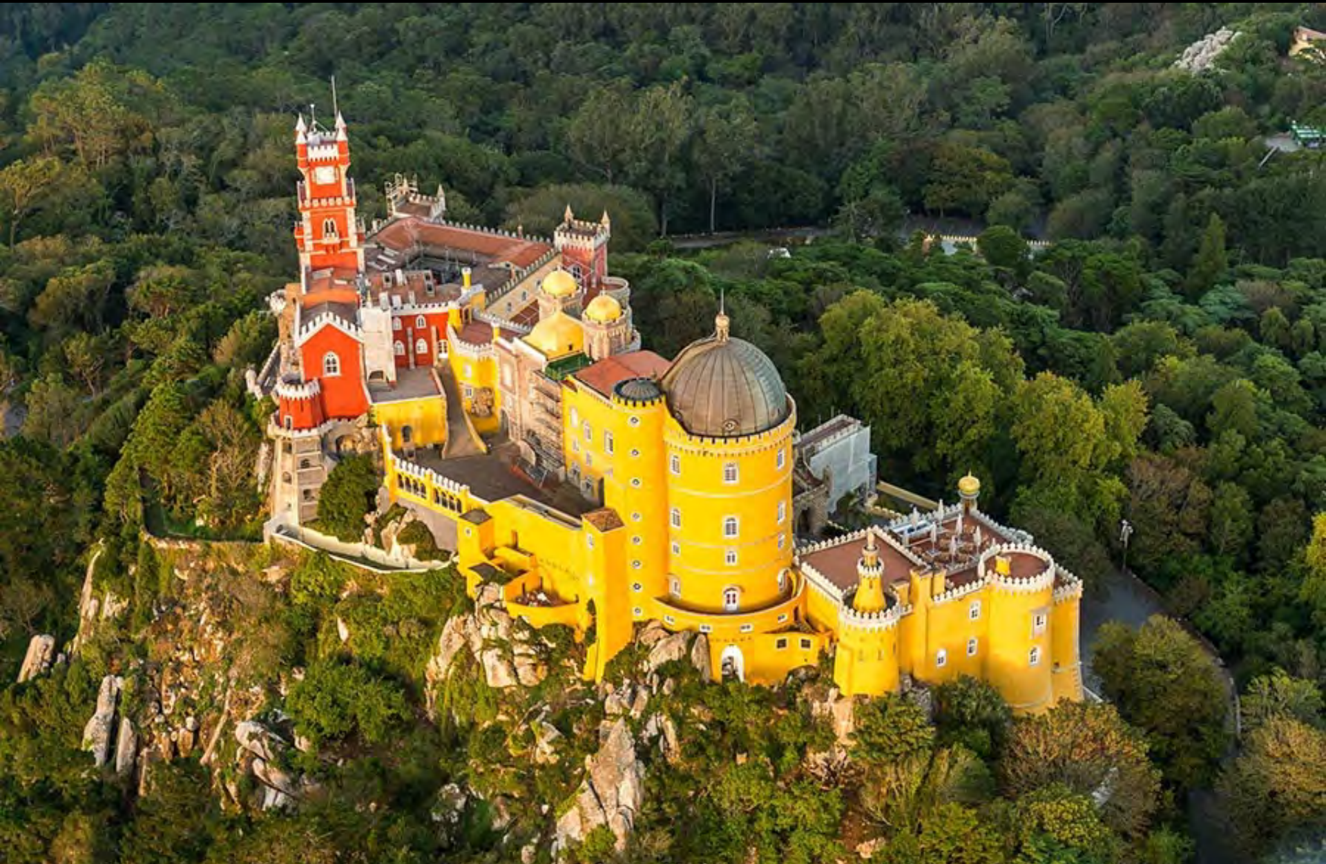
Pena Palace, Sintra